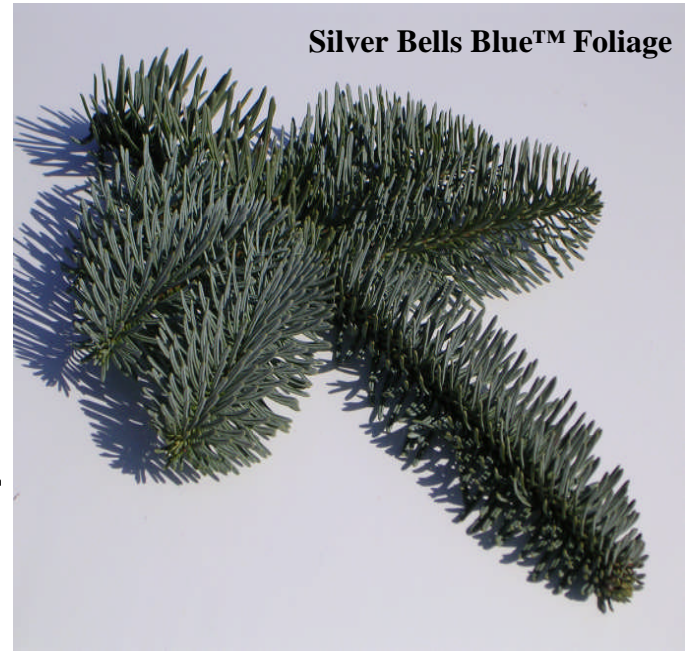
Silver Bells Blue™ Foliage

On average, our trees provide a narrower shape than other noble fir seed sources. This provides the customer with an easy to handle tree that fits nicely into their home and tree stand.